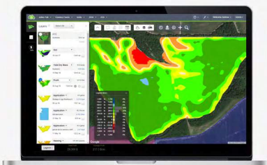
Turn data into dollars with Pixel Profit's predictive visual profit and loss mapping